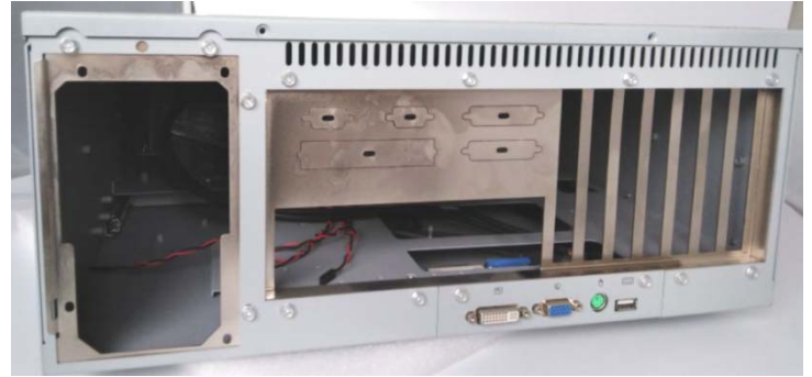
4U Rack Mount 8" TFT LCD workstation